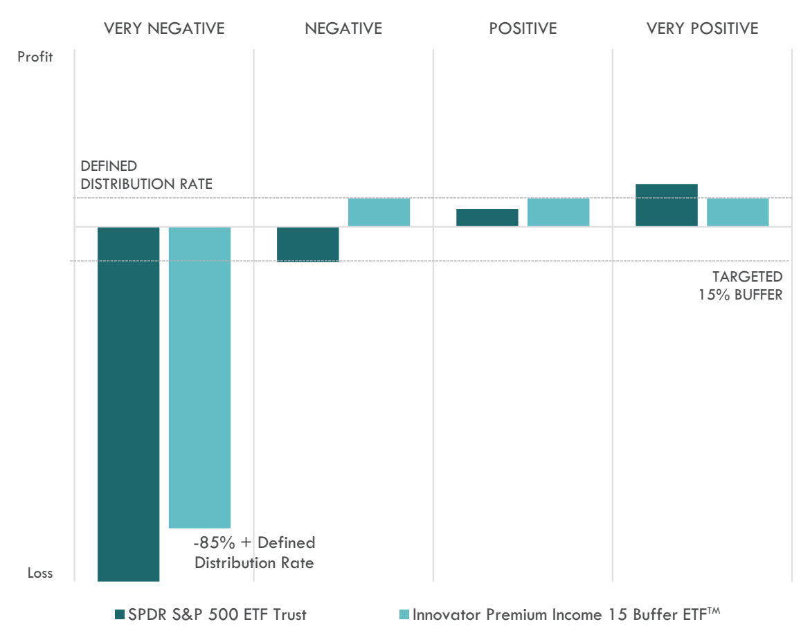
Please note this graph is provided merely to illustrate the Outcomes that the Fund seeks to provide based upon the performance of the SPDR® S&P 500® ETF Trust, the Buffer and the Defined Distribution Rate. There Is no guarantee that these Outcomes will be achieved over the course of the Outcome Period.

The below hypothetical graphical illustration is designed to illustrate the Outcomes that the Fund seeks to provide for investors who hold Shares for the entirety of the Outcome Period. There is no guarantee that the Fund will be successful in its attempt to provide the Outcomes for an Outcome Period. The Outcomes that the Fund seeks to provide do not include the costs associated with purchasing Shares and certain expenses incurred by the Fund.